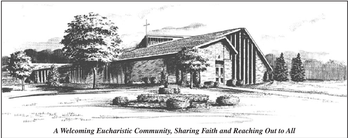
A Welcoming Eucharistic Community, Sharing Faith and Reaching Out to All